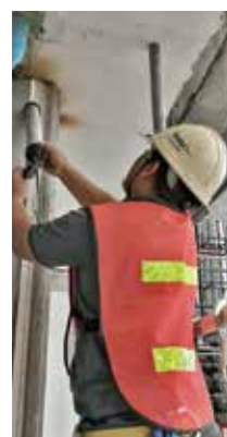
• On site Technical Service