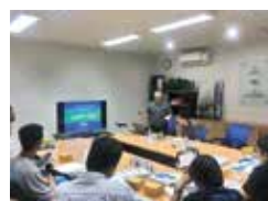
• Product training for customers