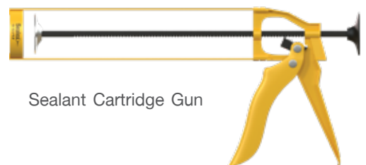
Sealant Cartridge Gun