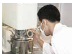
• Innovation of product